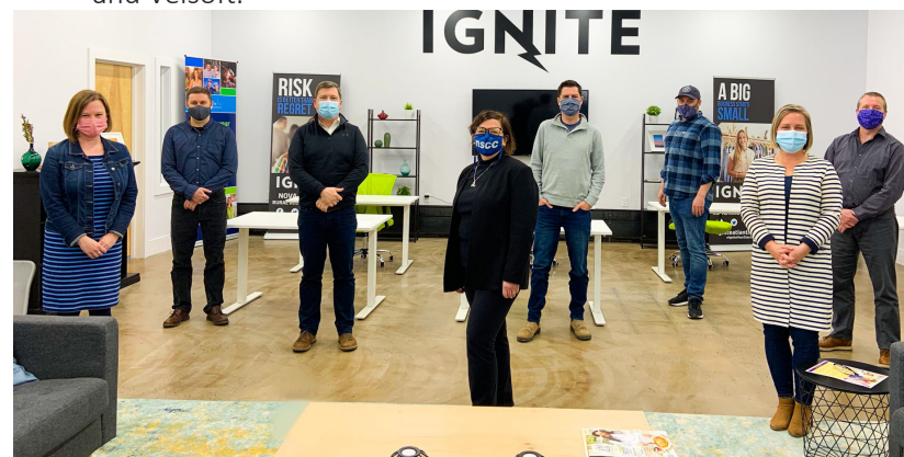
Photo: Pictured below are Pictou County MIT team members from PCREN, ACOA, Develop NS, NSCC, StFX, NS Spirit Co., and Velsoft.

The Pictou County Regional Enterprise is leading a local team of 10 community leaders through the MIT Regional Entrepreneurship Acceleration Program –Nova Scotia (MIT REAP-NS). This program provides opportunities for communities around the world to engage with MIT in an evidence based, practical approach to strengthening innovation driven entrepreneurial ecosystems. Locally, this skilled cross-sector group of business and education leaders will be implementing a project that will strengthen the business ecosystem in Pictou County.