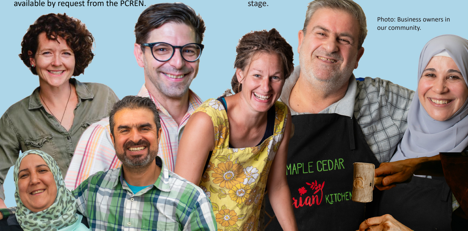
Photo: Business owners in our community.

This program has found a unique solution to fill labour market gaps, grow our community, and position Pictou County as innovative on a national and international stage.